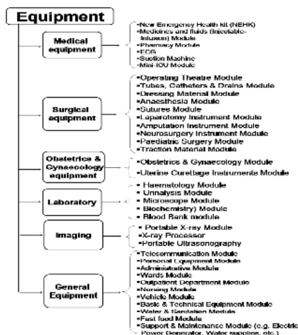
Figure 4: The appropriate equipment for the field hospital in earthquake

The equipment 1,28,32,33,44-46,52-56 are categorised into 6 main parts, which are presented in Figure 4 in details. The presence of Bacteriology, Serodiagnostic and Faecal parasite modules are considered inappropriate for the laboratory setting. The appropriateness of water testing module is uncertain. Portable CT-Scan Module is considered as inappropriate and Portable Colour Doppler Module as uncertain for the field hospital setting. Dental Unit, Dental Instruments and Portable Dental X-ray Modules are rated as inappropriate by the panel members. Skin-Graft Instrument Module, Auto-transfusion Instrument Module and ENT Module are regarded as inappropriate and Urologic Instruments Module as uncertain.